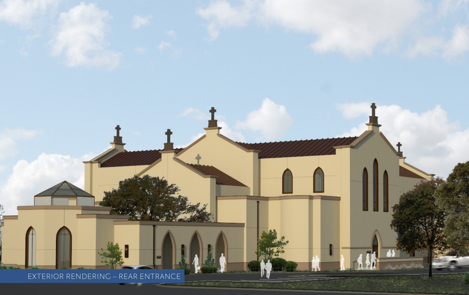
EXTERIOR RENDERING – REAR ENTRANCE