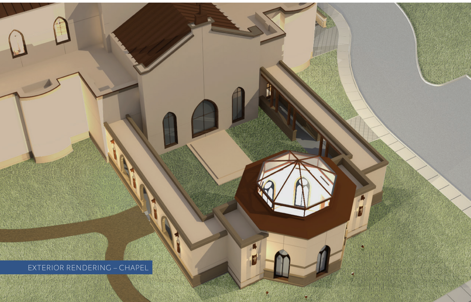
EXTERIOR RENDERING – CHAPEL